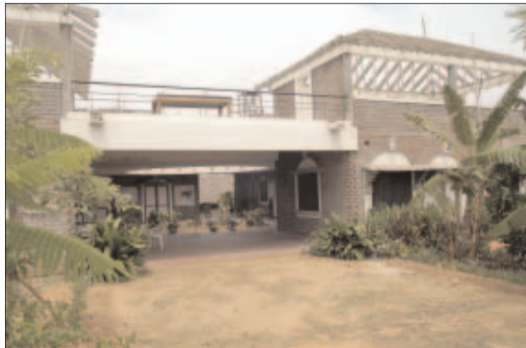
Entrance of the Village Action building in Irumbai

(women's clubs, men's clubs, parent-teacher associations and all their micro-projects and work camps, plus government projects for housing, income generation, women's literacy, and special programs for supplementary teaching in the schools and assistance to the indigent aged, handicapped and deserted or widowed women). Interestingly, now that we've had a chance to raise our heads and to look around, we see how much the scene has changed since we started our work in 1988. Many more of the village young people are getting educated and want to emulate lifestyles seen on TV and in Auroville; Auroville employment has much empowered village women who can be seen riding mopeds and calling the shots for their families; and there are many born-and-