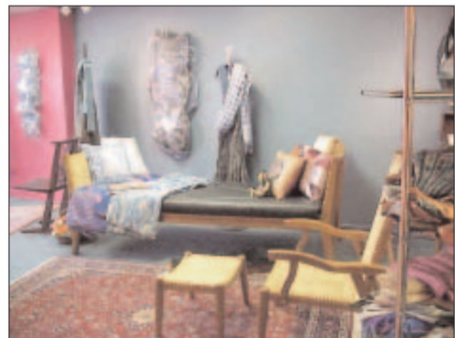
Inside boutique Mirabelle

◆Internatural, owned by Sri Aurobindo devotee, Santosh Krinsky, is one of the internet's most complete sources for health products, books, incense and related categories. Among their extensive incense lines, they carry Encens d'Auroville. Santosh set up a special portal for Village Action, where a percentage of sales go to support their important work: www.shop4avag.com/ or use the toll free fax line: 800-905-6887 or place your order with one of our customer service representatives at 800-742-5841 8:30 AM to 5:00 PM CST Monday through Friday, after hours and weekends orders may be left on our voice mail. Don't forget to mention Village Action.