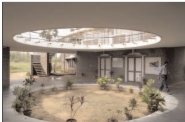
Inside the Village Action building in Irumbai

ulty which may result in Auroville being anthropologically researched and documented, the CIIS connection (only partially due to me) which will complete the "integral education" of