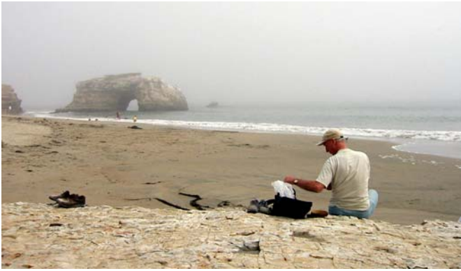
Guy enjoying his picnic in the fog at Natural Bridges State Park in Santa Cruz.