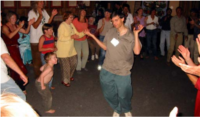
Young and old dancing to the traditional Moroccan tunes of Amarg, a local Santa Cruz band.