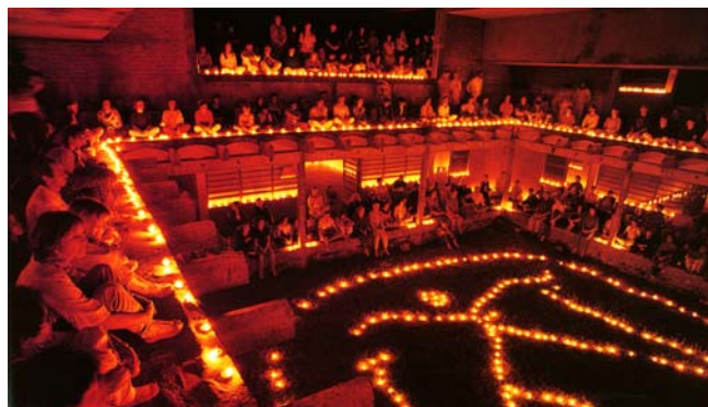
Two Thousand Lights - New Year Meditation at the Pavilion of Tibetan Culture in the International Zone.