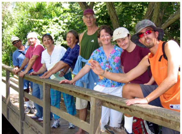
Some of us during our field trip to the Cosumnes River Preserve.

For more information on these regional gatherings, or to begin organizing one in your area, please write and email to info@aviusa.org or call the AVI-USA office at (831) 425-5620.