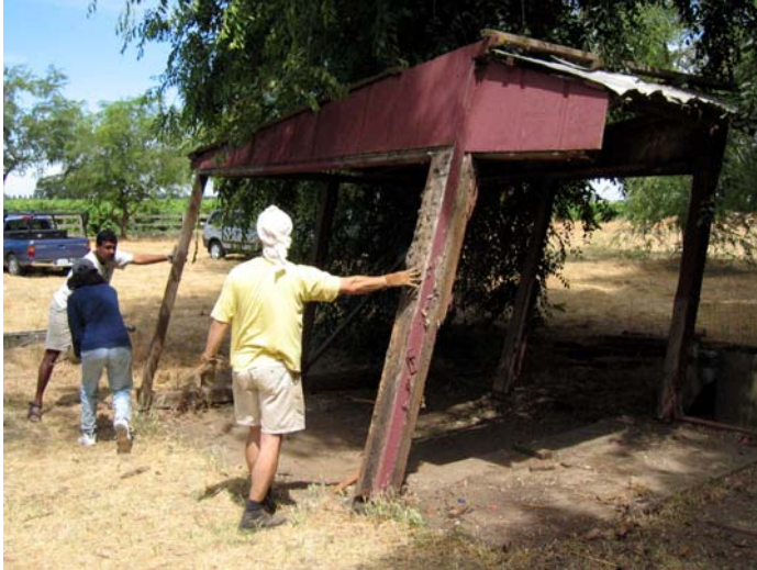
Demolishing the old to make way for the new

One of the works done was the demolition of a shed that was standing where our new addition will be built.