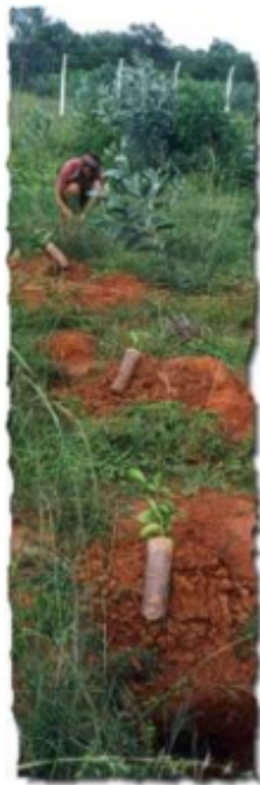
Tree planting in the new botanical gardens began last monsoon.

The more we learn about Mother's Nature, her laws and powers, the more we are inevitably brought to the conclusion that indeed we truly know very little. This realization is one of the foundation stones for the Auroville botanical gardens project. After 33 years of experiments, introduction of exotic and indigenous species and finally a fledgling ecosystem