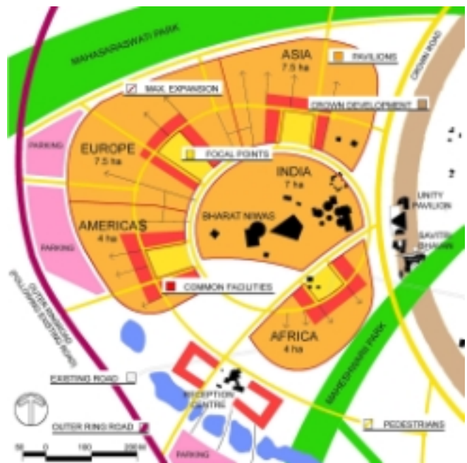
The new International Zone layout has continental regions, such as the Americas Site, within which national pavilions, such as the USA Pavilion, can be built.

For more information on the USA Pavilion, please write to jillswar@auroville.org.in , or to info@aviusa.org