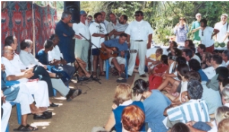
The consecration of the Americas Site of the International Zone on Feb 21 st , 2001 was a well attended, festive event.

We sang and read poetry and had a spontaneous serenade from a group of architects from Chile. It was another step forward. It was a privilege to be there.