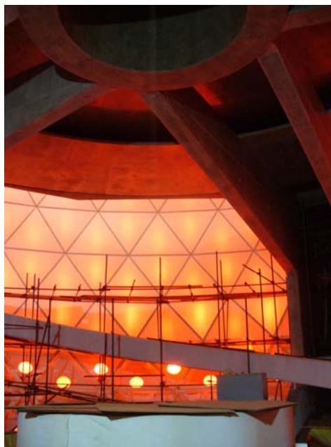
The inner skin and spiral ramp inside the Matrimandir.

the donation form on page 4, or by visiting us online at http://www.aviusa.org .