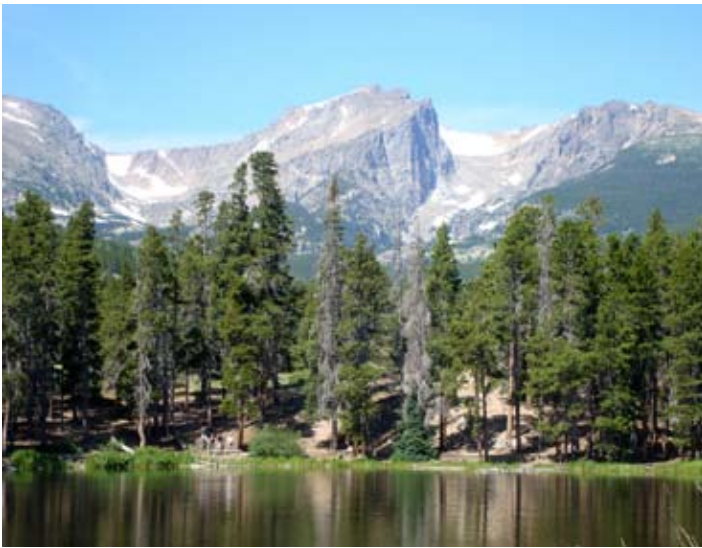
AUM 2008 will be set in the mountains of Colorado.